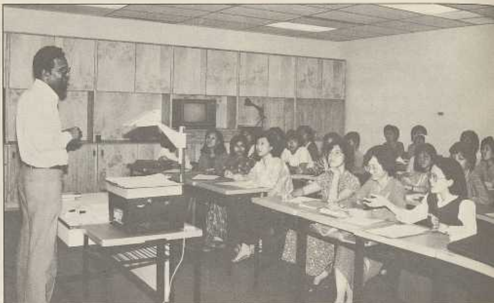
C & G Courses are currently held at the Bukit Merah Branch Library