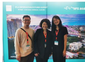
IFLA Information Futures Summit (IIFS) 2024: Stronger Together – Participant Reflections