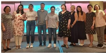
Get to Know Us! (3-part series on LAS Council)