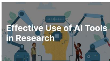
AI Literacy Digital Learning Object Developed Through SMU Libraries & TP Library Partnership