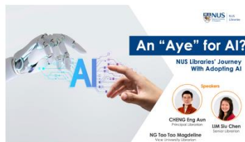
An "Aye" for AI? Librarians in the Age of AI