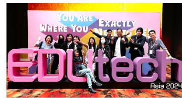
NUS Libraries at EDUTech Asia 2024: Showcasing Collections, Technology and Partnerships