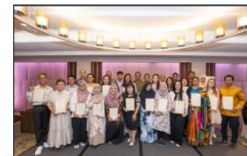
How SMU Libraries' ELLSSA Programme Can Make You a Catalyst for the Digital Transformation of your Library